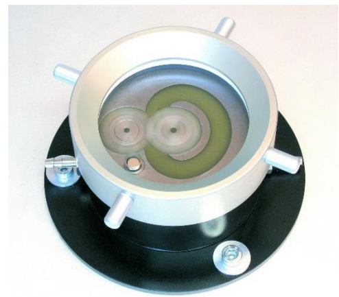
Gear type pump