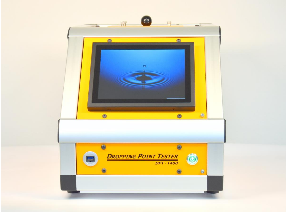
Dropping Point Tester DPT-T400

(The actual appearance of the Instrument may differ slightly from the illustration)